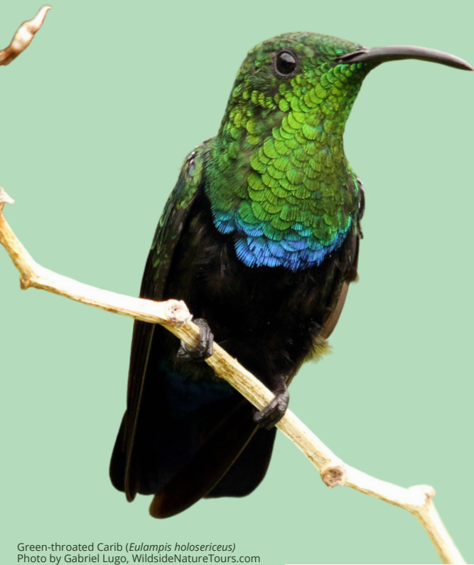
Green-throated Carib ( Eulampis holosericeus)