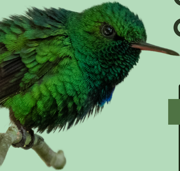
Puerto Rican Emerald ( Riccordia maugaeus)