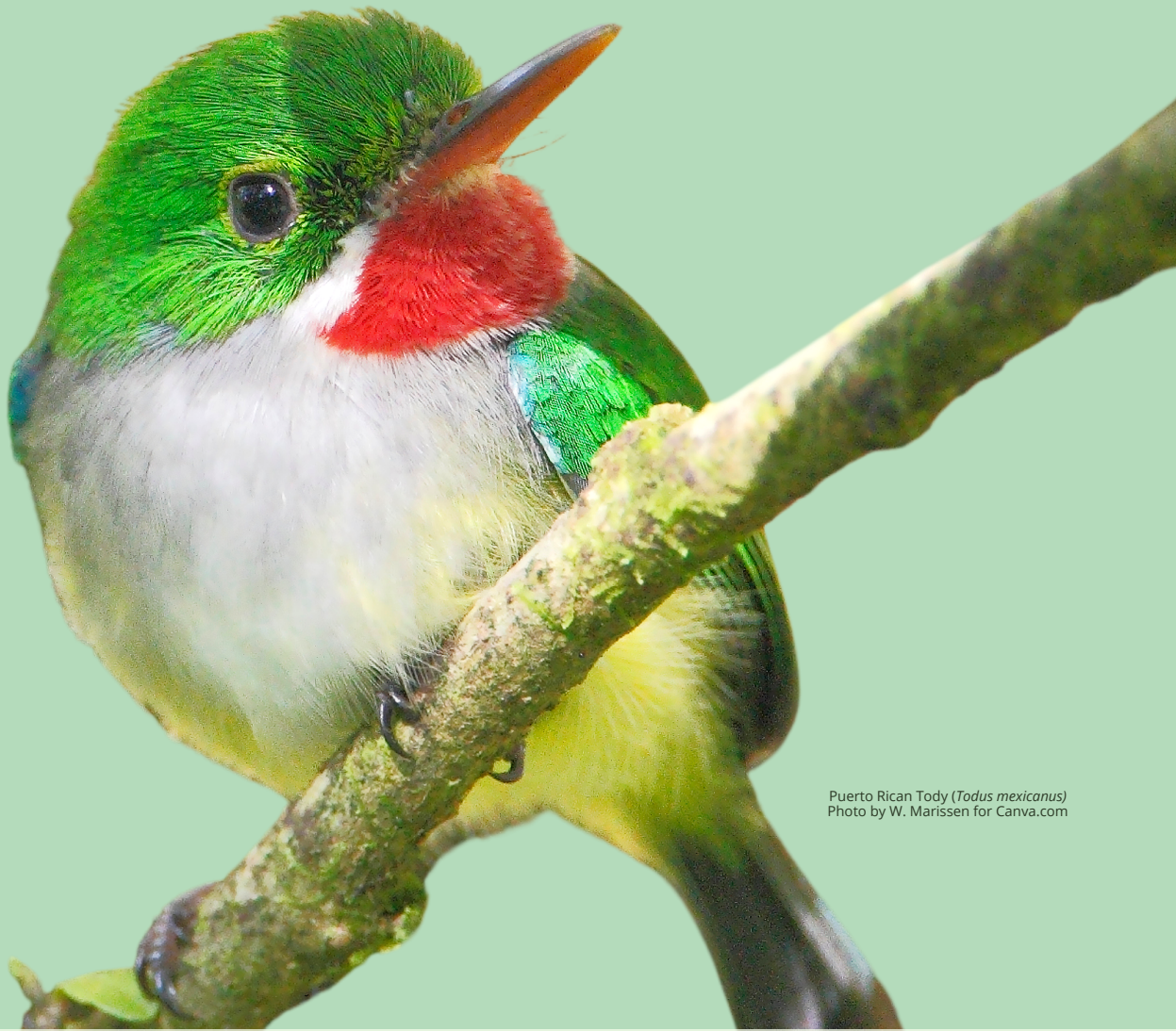
Puerto Rican Tody ( Todus mexicanus )