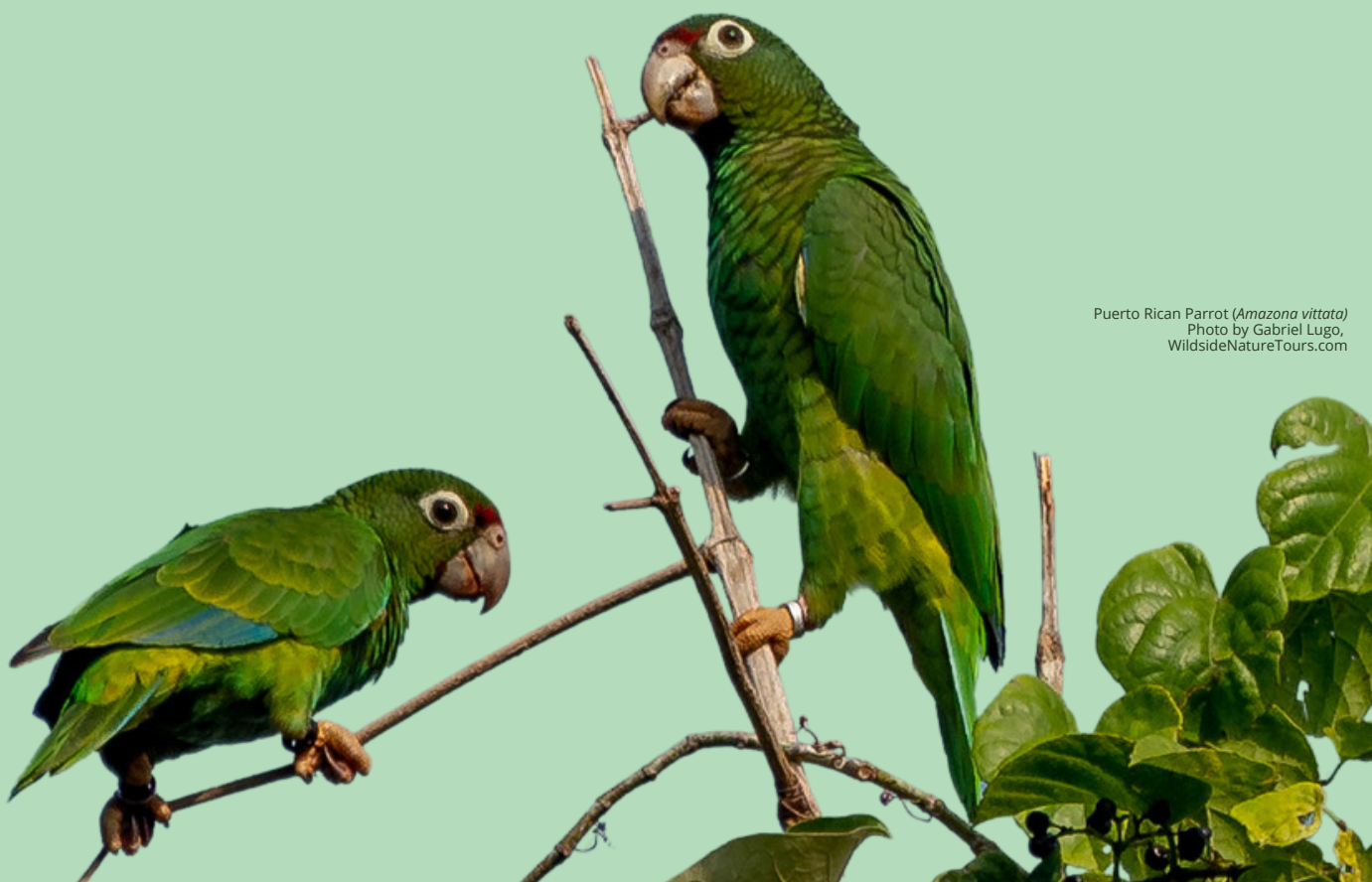
Puerto Rican Parrot ( Amazona vittata)

AOS & BC 2022 will highlight research that spans the breadth of modern ornithology through plenaries, symposia, workshops, roundtable discussions, contributed papers, and posters. Exhibitors from the commercial, non-profit, and government sectors will showcase new opportunities for partnerships. We will also host a series of daily, fun networking events for you to make new connections and reconnect with colleagues!