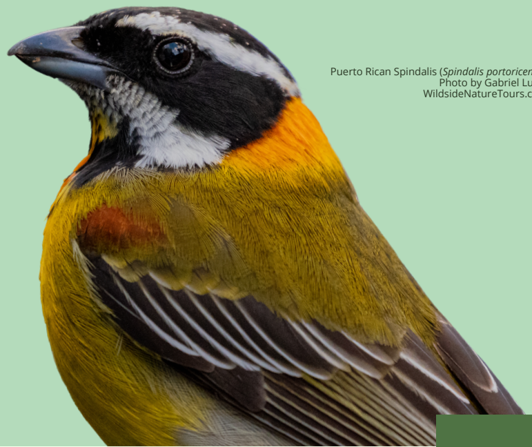
Puerto Rican Spindalis ( Spindalis portoricensis )